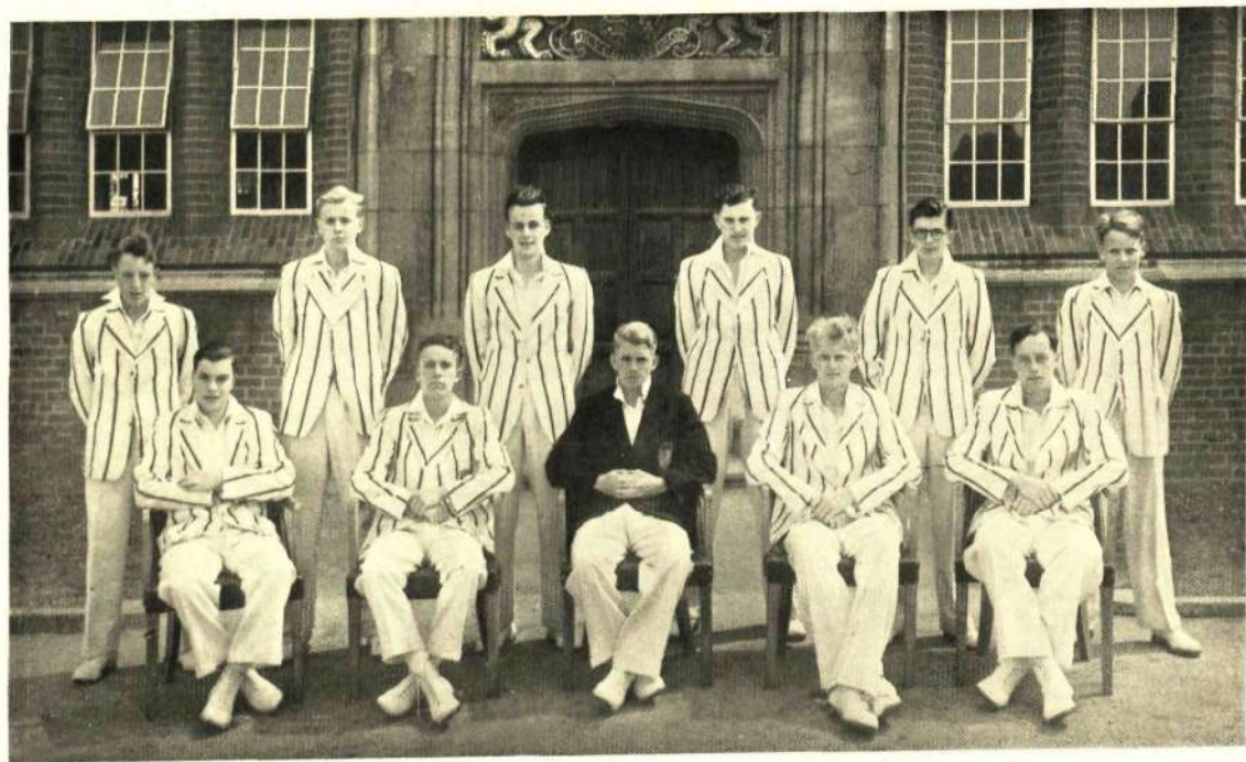
THE XI, 1952